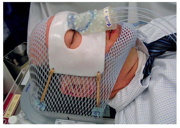
Fig. 1. A representation of a nasal HDR applicator for treatment of skin cancer of the nose

Univariate analysis was performed to determine association of treatment modality and tumor histology with LC using Pearson Chi-square test. Univariate analysis was performed to determine association of treatment modality with cosmetic outcome and toxicity using Pearson Chi-square test. Univariate analysis was performed to